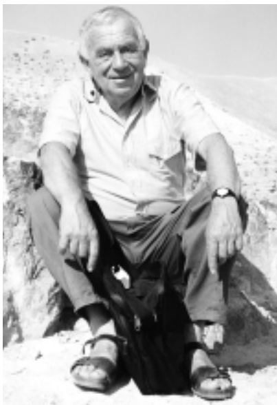
The Israeli poet Yehuda Amichai; his archive came to the Beinecke Library in 2000.

The work of enhancing and preserving the collections received a boost from more than one innovative project during the year. The university gave generous funding to the Archives 300 project as part of its Tercentennial program, and this enabled staff of Manuscripts and Archives to introduce a new university-wide records management program. As a result, the number and size of accessions to