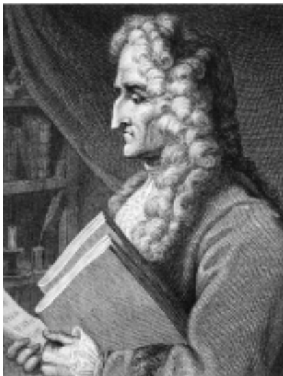
Portrait of playwright Thomas D'Urfey (1653–1723) from the Beinecke Library's Tercentennial exhibit accompanying the conference on Theater and Anti-Theater in the Eighteenth Century .

Library continued to work on its public health information Web site and worked with local hospitals, schools, and public libraries to enhance public awareness of the sources of health information. Three exhibitions from the historical medical library were mounted on the Web. The Beinecke Library and Manuscripts and Archives Department ran courses for teachers and organized school visits to see the collections. Two conferences arranged jointly by the Lewis Walpole Library and the Beinecke attracted high attendance: one on John Dryden and the second on Theater and Anti-Theater in the Eighteenth Century . Both were accompanied by special exhibitions and performances involving the School of Drama and other parts of the university. The Divinity Library mounted five exhibits during the year, including one online on the Centennial of the Boxer Rebellion in China , and the Ministry Resource Center, whose management was transferred to the library during the year, provided twenty-two workshops.