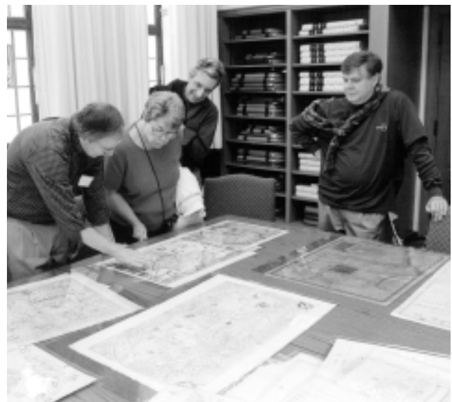
During the Tercentennial open house visitors explore the resources of the library's Map Collection.

Public programs increased significantly during the year, not only stimulated by the Tercentennial. The Medical