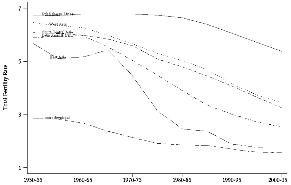
Fig. 2 Total Fertility Rates by Region