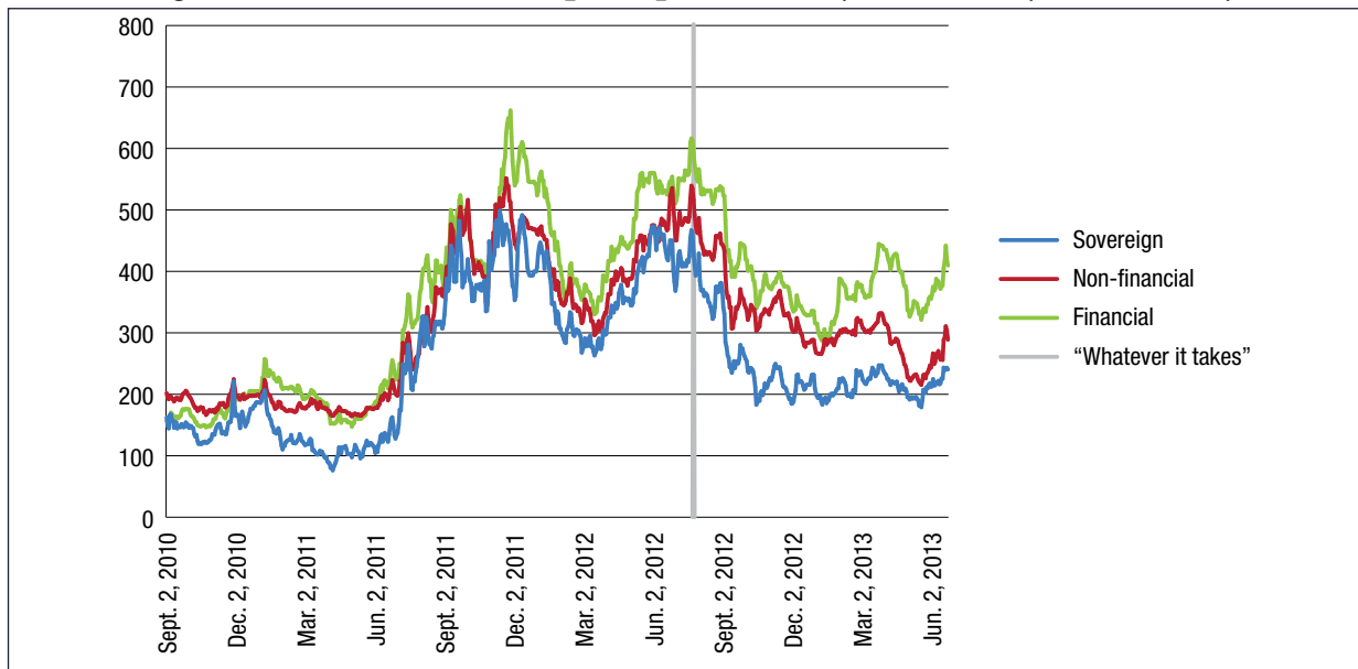
Figure 2a: Credit default swap risk premia on 5 year bonds by sector – Italy

The programme was thus successful because it addressed a fundamental problem of the monetary union. Countries in the eurozone do not have direct influence on monetary policy, but issue debt in euros. This constellation resembles a situation