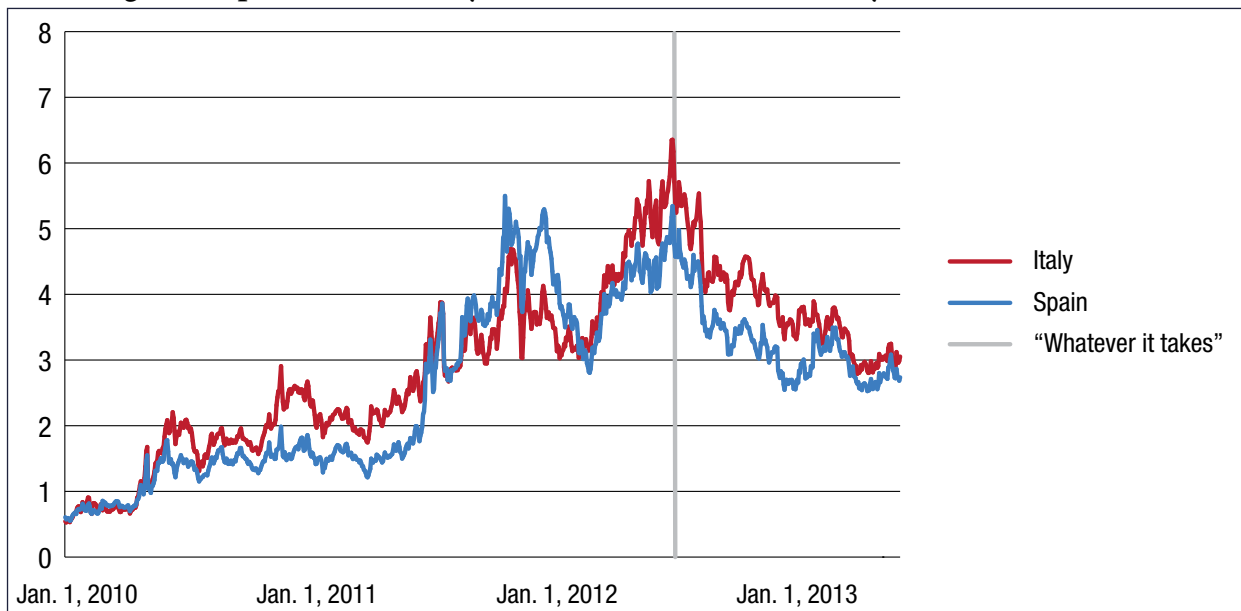
Figure 1: Spreads (%) on 10 year bonds relative to Germany (1.1.2010–9.7.2013)

The bad equilibrium is one in which doubts about the solvency of a government lead to a self-fulfilling crisis. Once investors start losing trust in the