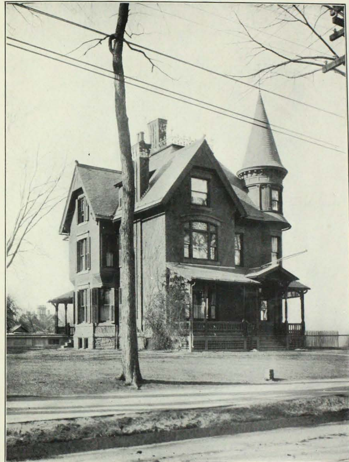
MUNSILL MATERNITY WARD.