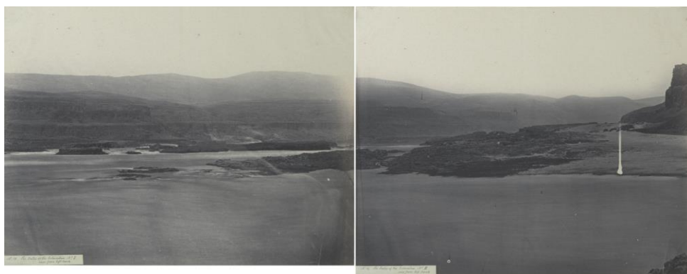
Figure 4: The Dalles of the Columbia, No. 1 and The Dalles of the Columbia, No. 2 . 18 Nearly contiguous views, digitally aligned, with mounts cropped digitally.

Adjacency of landscape views is also significant, revealing compositional strategies employed in attempts to document the landscape. Both the Beinecke set and the British sets preserve numbering that functions as subtitles to specific captions, such as The Dalles of the Columbia, No. 1 and The Dalles of the Columbia, No. 2 (fig. 4). A close relationship between the images is made explicit.