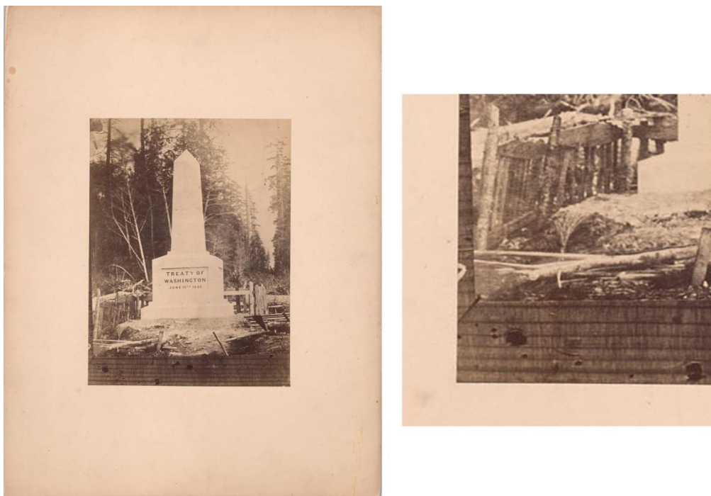
Figure 8: [Boundary monument at Point Roberts, west face—Treaty of Washington June 15th, 1846] and detail view of the same print at right. Early copy photograph with backing board and pin visible at bottom. Copies in other sets tend to be cropped more closely, but the board is visible in two Point Roberts obelisk views in British sets. (Bancroft Library BANC PIC 1963.040:01.)

The explanation lies in the relatively late date of the obelisk views. The imposing granite marker was erected by the British at the conclusion of the survey. It was scheduled to be completed in the fall of 1861, and some sources give 1861 as the date of the photographs that document it. However, evidence suggests that bad weather delayed erection, and the installation was not completed until late spring or summer, 1862. 28 By this date most of the British survey party, presumably along with its photographers, had returned to England. Most likely the views of the obelisk were taken and printed in the Pacific Northwest and prints were sent to the Royal Engineers in England, where they were copied for inclusion in the survey sets. If this scenario is correct, it also suggests that Americans Harris and Gardner may have received their personal sets of prints after returning east, as the presence of obelisk views suggests the sets were made up after those prints