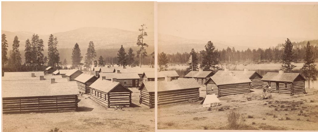
Figure 1: British Commission winter-quarters at Colville, on left bank of Columbia river, No. 1 (right) and No. 2 (left). Aligned, mounts cropped, and tones balanced digitally.

region of the 1860 summer and fall season (between the Similkameen and Pend Oreille Rivers), and prior to views of the region that the British did not enter until the 1861 season (from the Kootenay and Moyie Rivers to the Rocky Mountains). 16