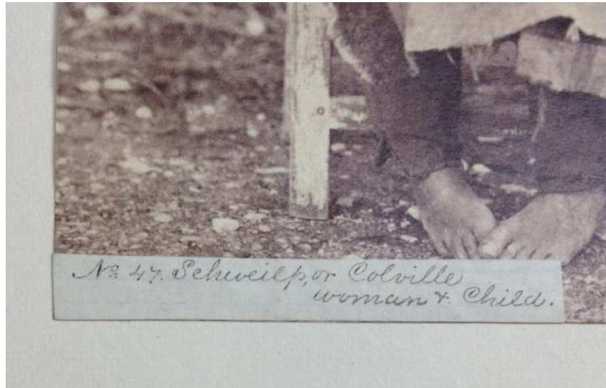
Figure 7: Paper label typical of those appearing on British official sets. (Royal Engineers 6/33B, No. 47.)

Another example of useful physical evidence is found on four prints. Four views of the obelisk marking the 49th parallel at Point Roberts, the westernmost point of the land survey, may all be early reproductions. The edges of some examples reveal the edge of the original photographic print and a wooden backing board to which the print is pinned for photographic copying (fig. 8). This was first observed on prints at Bancroft Library, leading to conjecture as to whether the Bancroft set consisted of nineteenth-century copy photographs rather than prints from the original negatives. 27 This visible backing board, however, can be seen on some of the obelisk views in the British sets as well, and has not been observed on any of the other survey photographs, at Bancroft or elsewhere.