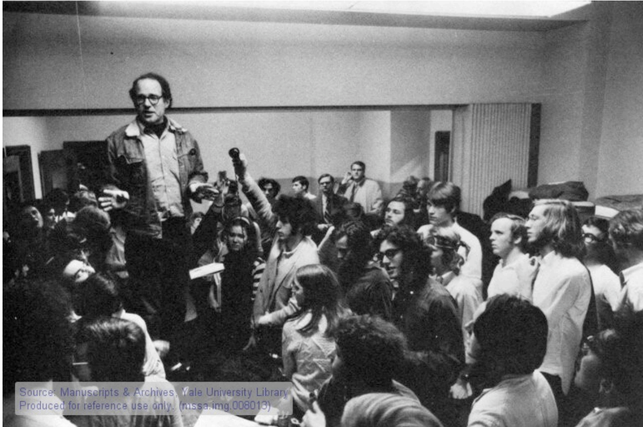
Figure 1: Rev. William Sloane Coffin, Jr. addressing a Yale Campus group. Printed in the Yale Banner, 1970.

“To have been at a place where there was a figure of this sort...a person who made the civil rights movement seem not a distant thing but something we ourselves were morally and mentally engaged in, and the same then for the anti-war movement, was I think one of the great experiences of our time.”